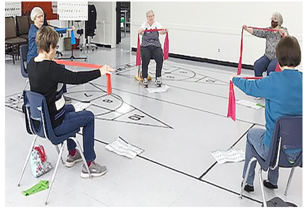
Resistance Band on hold until the fall.

Be Active Adults aged 65 years and older should accumulate at least 150 minutes of moderate to vigorous intensity aerobic physical activity per week in bouts of 10 minutes or more. Plus, it is beneficial to add muscle and bone strengthening activities, like exercising with bands, at least 2 days per week.